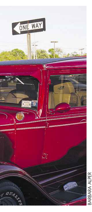
running 6-10 p.m. Fridays er permitting, at the LIRR shway. pellmorechamber.com spectators, $3 per car

tpreserveconservancy.org ON $35 ($20 ages 4-12, free nger); includes parking