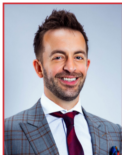
Benny Benack III (Trumpeter, Vocals)