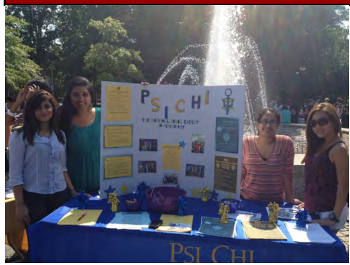
Psi Chi at their 2013 Involvement Fair.

service trips to the Stony Brook Hospital.