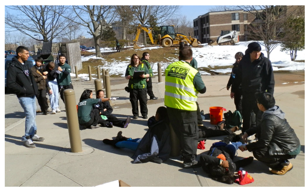
C-CERT practice drill.

Pre-Med Society will also be hosting their annual Scavenger Hunt and CPR Training at SBU Hospital Heart Institute this semester. Anyone interested in joining can attend general body meetings Tuesday nights at 7:00pm in SAC 302 or email sbpremedsociety@gmail.com for more information.